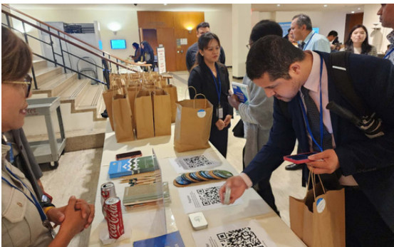
Side event participants

APFNet organized a side event titled “Contributions to Sustainable Forest Management and the Sustainable Development Goals through Demonstration Projects, Regional initiatives and collaborations.” together with the Royal Forest Department of Thailand on 9 May 2025, during the 20th session of the UN Forum on Forests took place from 5 May to 9, 2025, at the UN Headquarters in New York, USA.