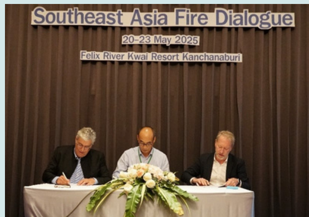
Signed an agreement to officially launch the Southeast Asia Fire Management Mechanism (SEA-FiMM)

The Southeast Asia Fire Dialogue, a pivotal four-day event co-sponsored by the APFNet, RECOFTC and Tropenbos International, concluded in Kanchanaburi, Thailand. The dialogue, held from May 20-23, brought together a wide array of stakeholders to address the escalating challenges of wildfires in the region and culminated in the landmark launch of the Southeast Asia Fire Management Mechanism (SEA-FiMM).