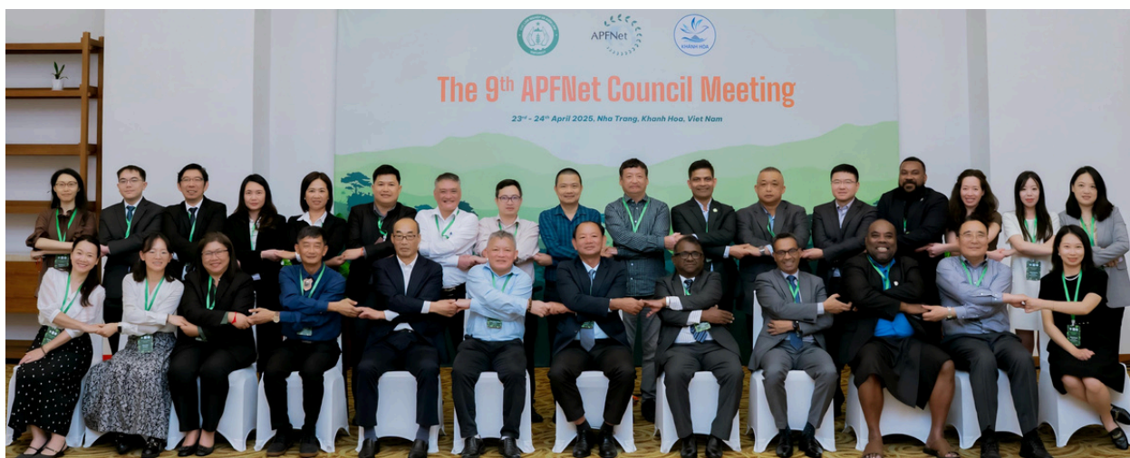
Group photo. Council members

The Ninth Meeting of the APFNet Council and Board of Directors took place in Nha Trang, Vietnam, from 23 to 25 April 2025. The events were held in a hybrid format and hosted by the Vietnam Forestry Administration, Ministry of Agriculture and Rural Development, Vietnam.