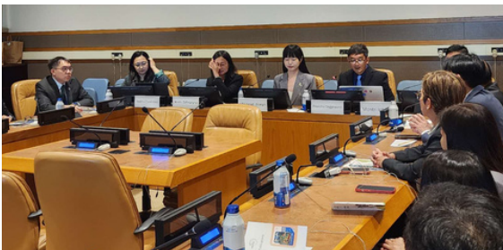
During the side event

APFNet organized a side event titled “Contributions to Sustainable Forest Management and the Sustainable Development Goals through Demonstration Projects, Regional initiatives and collaborations.” together with the Royal Forest Department of Thailand on 9 May 2025, during the 20th session of the UN Forum on Forests took place from 5 May to 9, 2025, at the UN Headquarters in New York, USA.