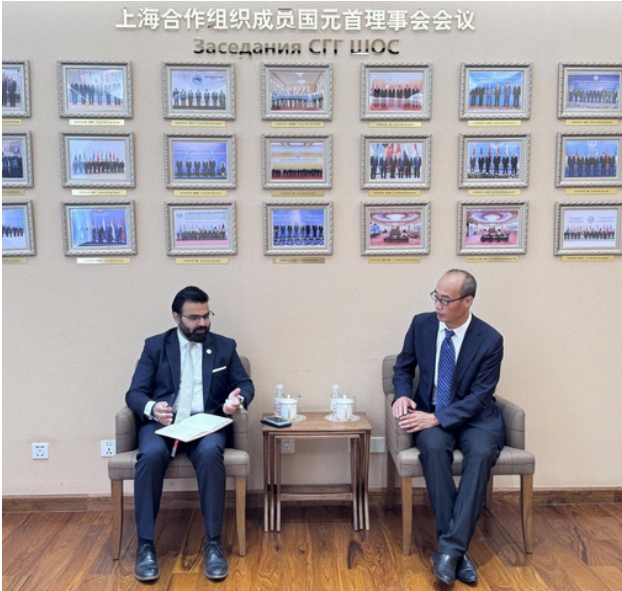
During the meeting at SCO