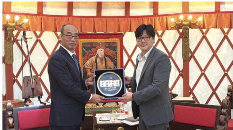
Commemorative gift exchange during the bilateral meeting